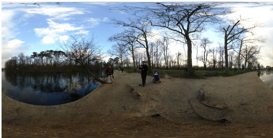
(b) After vignetting, exposure and white balance correction