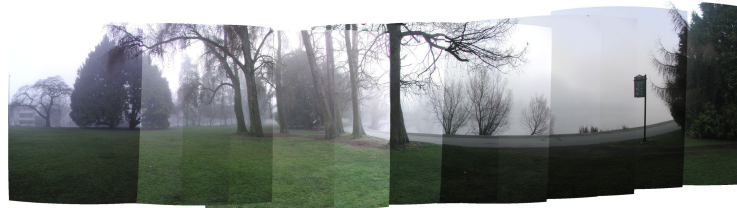
(a) No correction