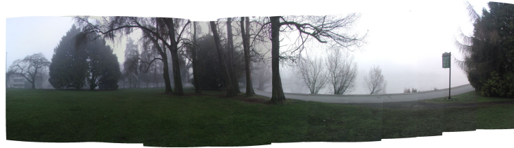
(b) After vignetting, exposure and white balance correction