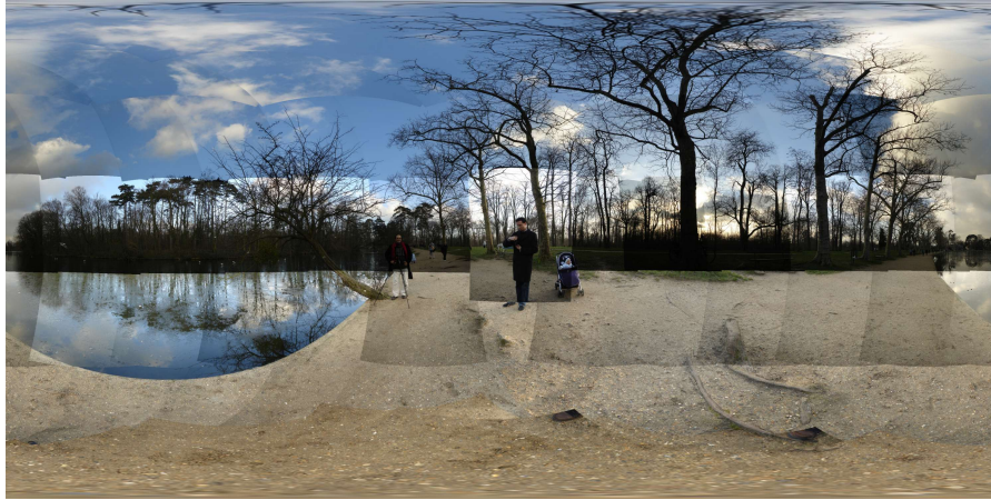
(a) No correction